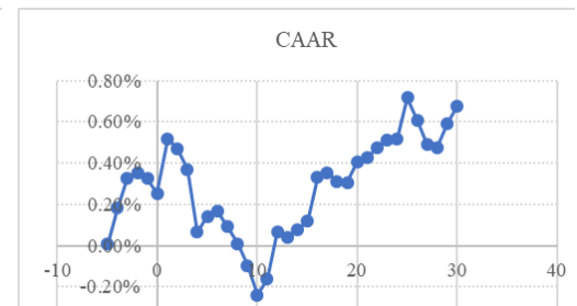
Figure 3: Abnormal sell events

Figure 4: Abnormal sell on net sell days