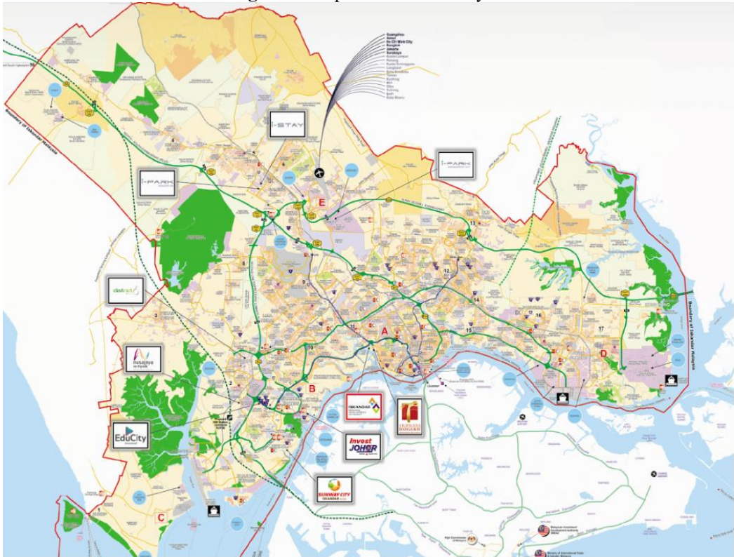
Figure 1: Map of Iskandar Malaysia

Johor is recognised as one of the most popular destinations for domestic and international tourists (Devi, 2022) and one of the fastest-growing economic states in Malaysia due to the establishment of Iskandar Malaysia, the Southern Economic Corridor in 2006. The Majestic Johor Festival (MJF), held in Puteri Harbour, Iskandar Puteri, concluded with resounding success, drawing over 20,000 more visitors than the previous year (Shafeq, 2024). This significant increase solidifies Johor, particularly Iskandar Malaysia, as the premier tourism destination in the country. Iskandar Malaysia or previously known as the South-Johor Economic Region or SJER covers 12 per cent of the Southern region, between the Pontian on the Western Coast and Pasir Gudang on the Western bank of the Johor River, extending as far North as Kulai (Rahman & Ching, 2020). Iskandar Malaysia is divided into five flagship zones, namely, Johor Bahru City Council (MBJB) or Johor Bahru City Centre or Zone A, Iskandar Puteri City Council (MBIP) or Nusajaya or Zone B, Pontian Municipal Council (MDP) or Western Gate Development or Zone C, Pasir Gudang City Council (MBPG) or Eastern Gate Development or Zone D, and Kulai Municipal Council (MPKu) or Senai-Skudai or Zone E, as shown in Figure 1 (Iskandar Malaysia, 2023).