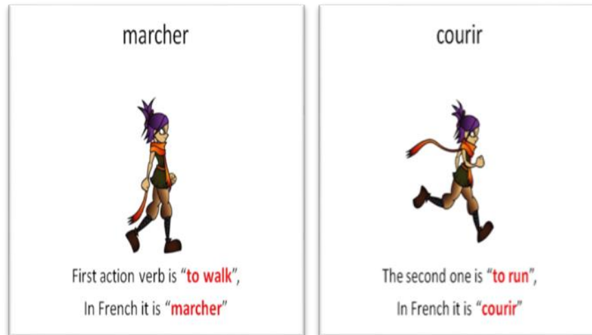
Figure 1. Selected frames from the multimedia presentation of the ANT group.

along with concurrent narration and on-screen text, whereas Figure 2 shows selected frames from AN which include animation and concurrent narration.