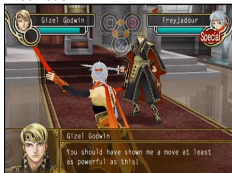
Figure 5 Rock Scissors Paper System in Suikoden V