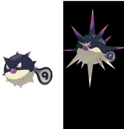
Figure 2 Qwilfish Evolves Into Overqwil in Pokémon Arceus

that associatively signifies spikes. “Barrage” and “twenty” are visually associated with the numerous spikes protruded from the body. If these two associative meaning, “sharp spines” and “number of spikes” are connected, the gamers would be able to decode how to evolve Qwilfish.