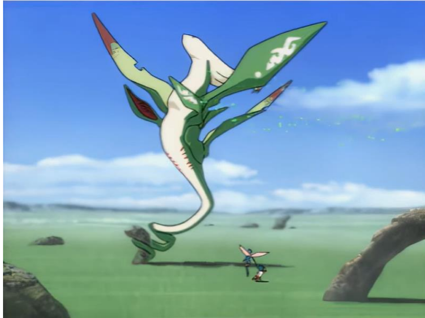
Figure 1 Orbital Clues with Visual Assistance in Capcom's Breath of Fire IV

displays the shining bird as the gamers enter the plain. The only distractor generated by the puzzle is the fact that it is a bird, the gamers would have to keep a distance from the bird or else it will fly away.